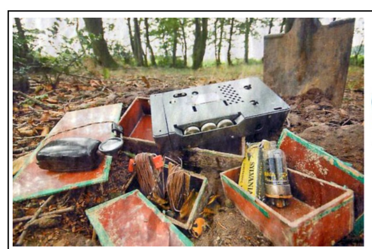
The 'Type 4' in this photo was found buried in a cache. Considering the absence of corrosion of the transmitter and other parts, it appeared to be well preserved. (Source of photo unknown).