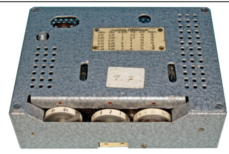
Transmitter 'Type 2' seen from the control panel side.