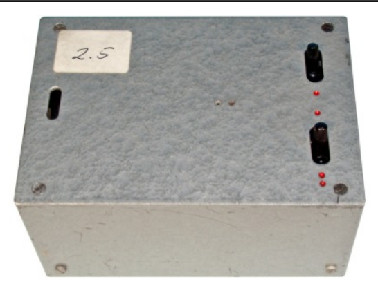
AC mains power unit issued with a 'Type 2' transmitter. Variations in construction of this unit are noted.