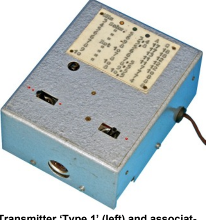
Transmitter 'Type 1' (left) and associated AC mains power unit. (right)