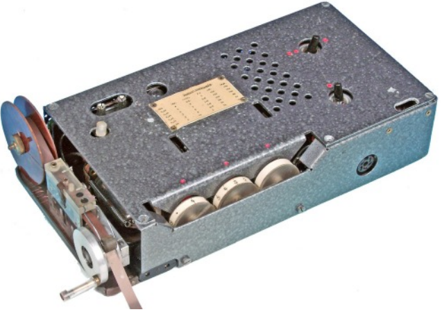
Transmitter 'Type 4' was essentially a 'Type 2' with built-in AC mains power unit (right hand side with two switches) and a Handschnellgeber (See Chapter 98) fitted at the other side of the set.